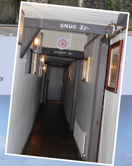
Right: The Bear Inn, Faversham. Walking down the side corridor which connects the rooms is like walking back in history.