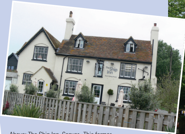
Above: The Ship Inn, Conyer. This former baker's shop and blacksmiths became a pub in 1802.