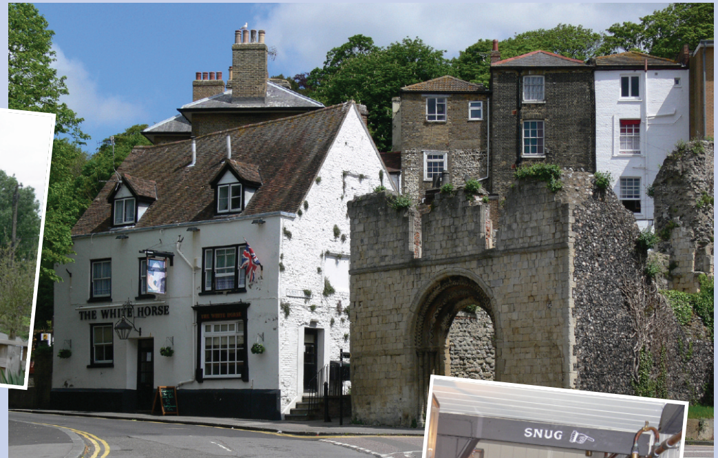
Above: The White Horse, Dover. The original building on this spot was erected in 1365 as accommodation for the Churchwarden of neighbouring St James.