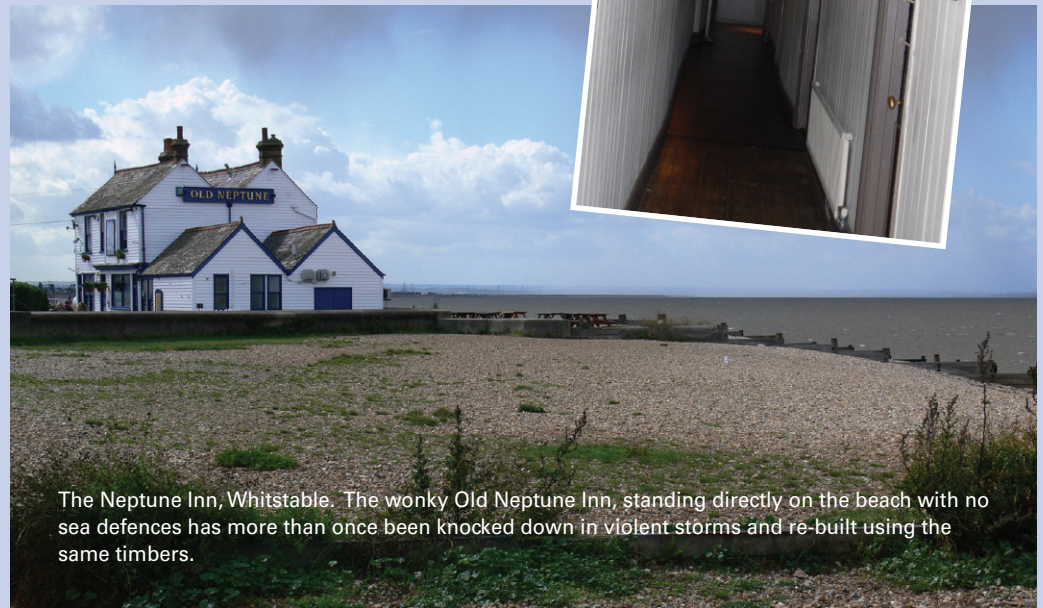
The Neptune Inn, Whitstable. The wonky Old Neptune Inn, standing directly on the beach with no sea defences has more than once been knocked down in violent storms and re-built using the same timbers.